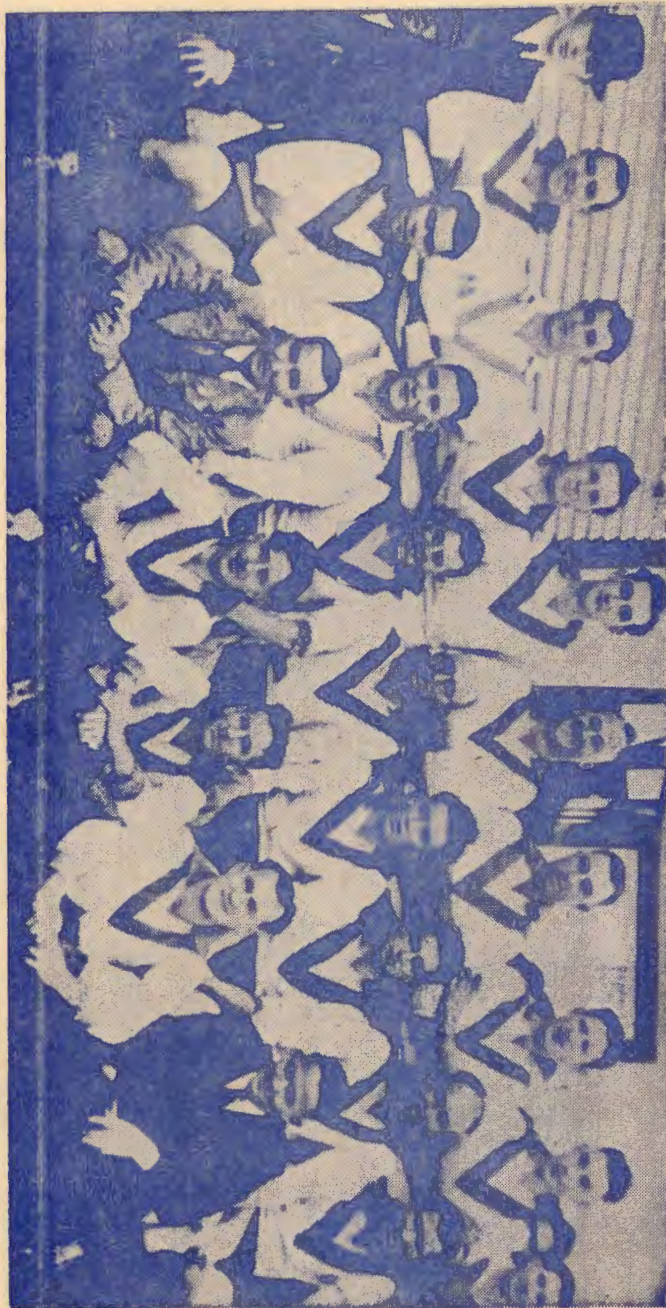
1948 RIVERINA XVIII WHO PLAYED A VICTORIAN 2nd XVIII AT LEETON